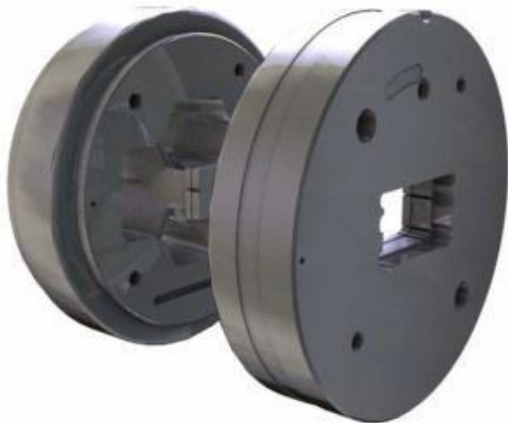
Tools for hollow profiles